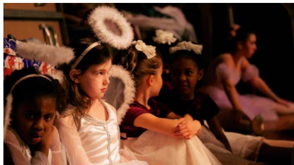
Backstage at rehearsal for The Nutcracker (2014)