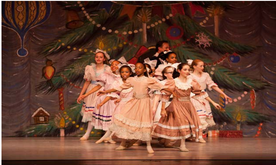
Above: Local youth perform in The Nutcracker with the Donetsk Ballet of Ukraine (2014)

Each December IBE presents the Donetsk Ballet of Ukraine's production of The Nutcracker , featuring the company's professional dancers supported by a cast of up to 50 local children and youth drawn from an open audition. IBE presents one show for the Philadelphia school district and two shows for the Greater Philadelphia community. Each spring IBE presents a fully staged story ballet for the school district, performed by a youth cast, guest artists, and including the residency students. Among the ballets IBE has brought to the school district are Alice in Wonderland , The Four Seasons , A Midsummer Night's Dream , Gaité Parisienne , La Boutique Fantasque , La Fille Mal Gardée , and our original ballets set to opera, Carmen , and Porgy and Bess .