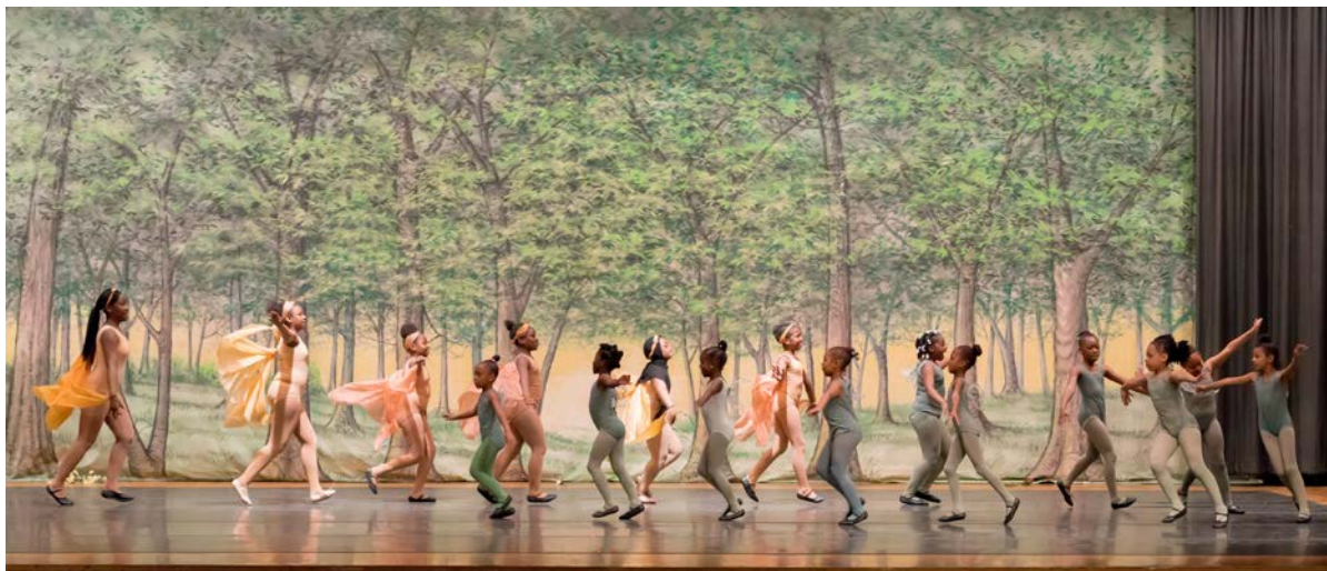
Above: Blaine Elementary School students (grades 1-4) performing in A Midsummer Night's Dream June 2017

Studying ballet over a 30-week period, especially with IBE's qualified and inspiring teachers, offers a unique opportunity to develop physical and mental skills, and it exposes students to the music, mathematics, and vocabulary of dance, and to the long-term goal of being part of a performance. The students build transferable skills of focus, goal setting, commitment, teamwork, and develop the self-respect that comes from mastering a complex skill.