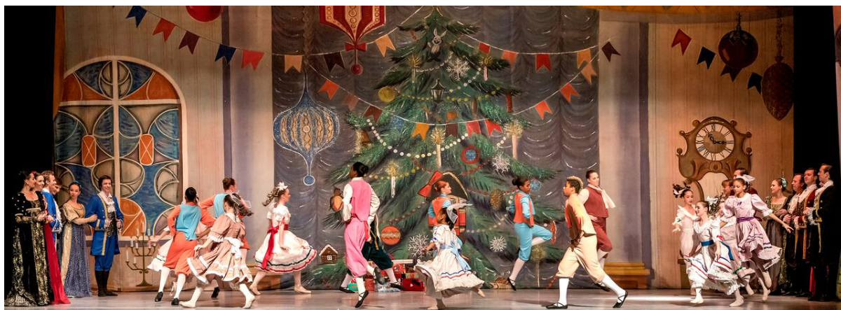
Below: Local youth perform in The Nutcracker with the Donetsk Ballet of Ukraine (2015)