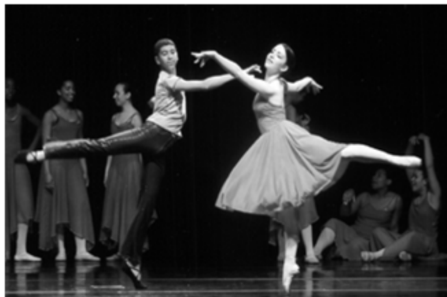
Below: Students from Wissahickon Dance Academy in Porgy and Bess (2004)